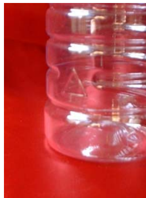
Tactile hazard triangle