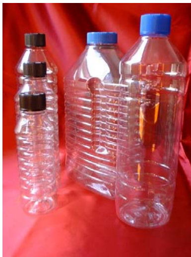
Examples of white spirit and Barbecue fluid bottles with CRC closures

Target markets for these bottles include the household market (trigger spray and antiseptic/disinfectant), and the DIY market (white spirit, BBQ, wall-paper stripper). A key feature on the bottles for potentially hazardous products is the tactile hazard warning triangle for the visually impaired (see below).