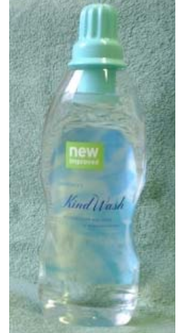
The original Fabcon range

A standard range of neck finishes has been designed to fit wadded or bore-seal closures from cap suppliers such as Kalmar, UCP, Dragon Plastics, Canyon and Scanbech.