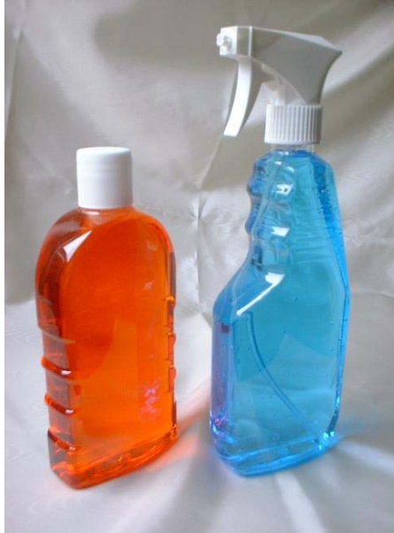
The new household range: Examples of trigger spray & disinfectant bottles

One of the first 38 mm neck PET bottles developed by Esterform was to fit dosing and pouring caps for use with fabric conditioners and similar products.