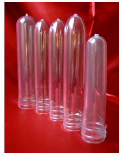
The preforms used for the household bottles