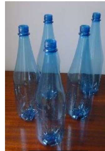
The new "wine" bottle

As in all new product design for Esterform, the optimum solution for the customer was sought.