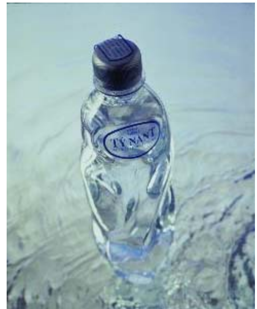
Tÿ Nant's 500 ml PET bottle

Esterform worked closely with R & D, and moulds were produced and bottles blown on Esterform's development machine. Esterform now supplies the preforms.